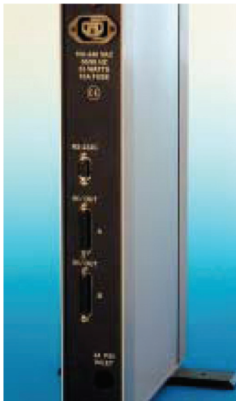
RS-232 output and analog ports are conveniently located on rear side